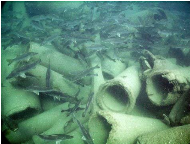
Snook gathering on the Civic Center Reef.

Please consider S.H.I.P., Inc., when doing your estate planning!