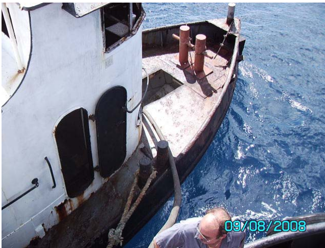
Prepping the Tug Lesley Lee for deployment.